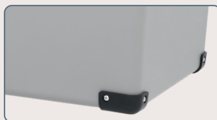
Protective foot pad