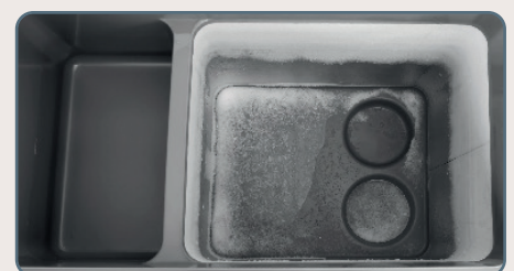
Fridge/freezer dual zone