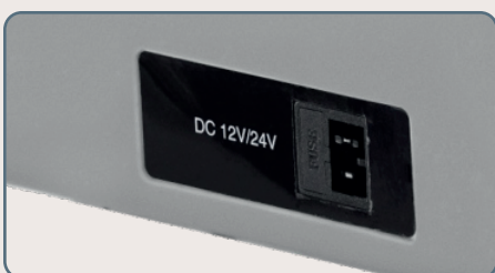
AC/DC dual use