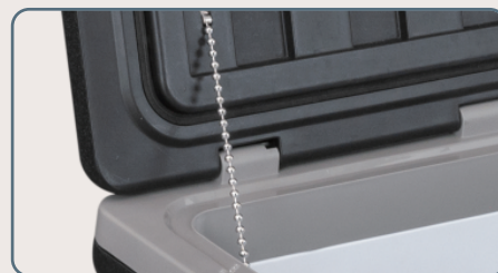
Pull chain fixture