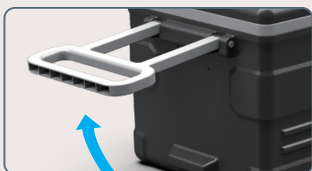
Heavy duty pull rod